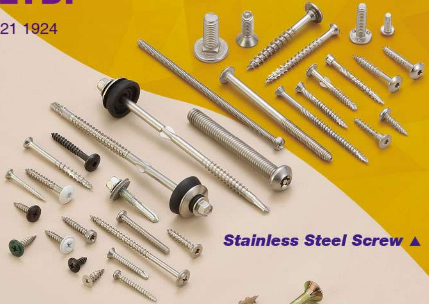
Stainless Steel Screw ▲